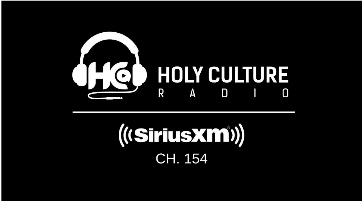
Holy Culture Radio Logo